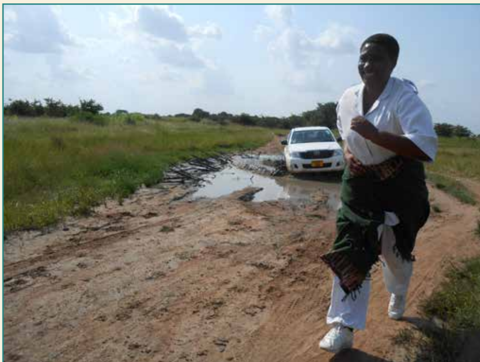
Health outreach work in rural Tabora, Tanzania