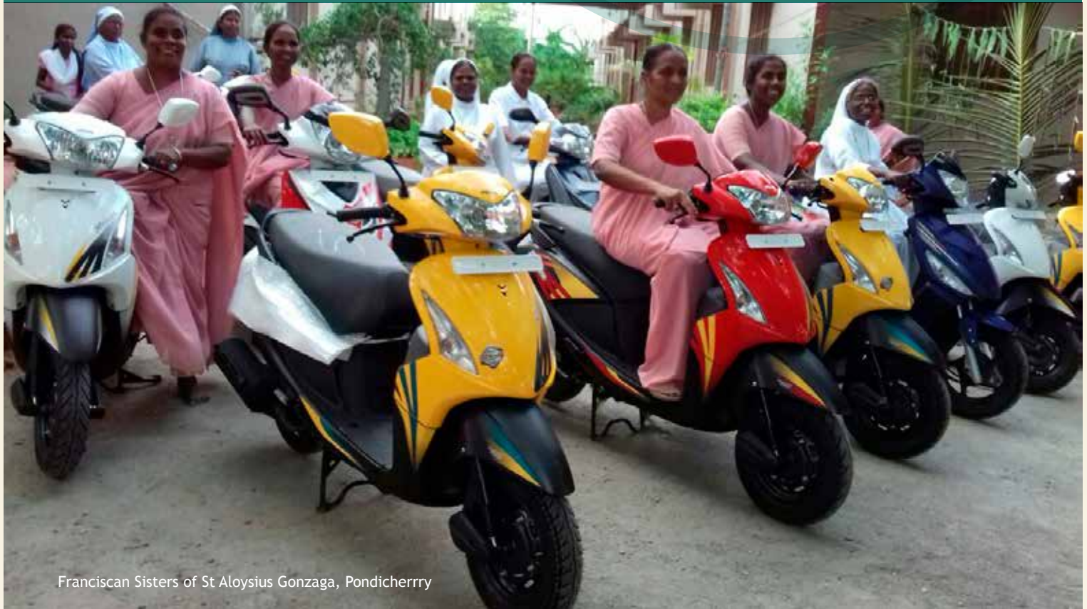
Franciscan Sisters of St Aloysius Gonzaga, Pondicherry

www.survive-miva.org Getting others back on the road to self-help